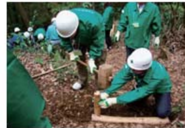
Tree-thinning activity on Mount Takao

In April 2009, 27 employees, their families and retired executives participated in a hands-on environmental conservation experience on Tokyo's Mount Takao that we organized. This marks the seventh year this event has been held, and this year, in addition to thinning trees on the mountain forest slopes and peeling the wood of trees that had been thinned, group activities also included the study of vegetation and educating employees in environmental awareness.