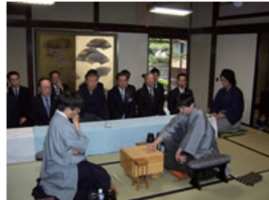
Shogi Meijin Title Match

We also focus on supporting traditional Japanese culture such as shogi and go . In addition to sponsoring the top title matches in shogi and go , the Meijin Title Match ( shogi ) and the Honinbo Tournament ( go ) since 2005, we are also the special sponsor of the Daiwa Securities Cup shogi and go title matches via the Internet. In shogi , we support the Saikyo Tournament and the Women's Saikyo Tournament, which were the first official shogi matches to take place on the Internet, in 2007. In go , we support four tournaments: the Open, the Ladies and the Grand Champion Internet title matches, as well as the Amateur Championship. These matches take place on the Internet year-round, and viewers can also watch the matches in real time on the Internet. The matches, which begin at 8 p.m. on weekend evenings, attract a strong following among not only Japanese fans but also shogi and go devotees living abroad. For playoff games in the various tournaments, we organize commentary sessions by professional players who use large boards to describe the game's moves, with the games taking place at the Daiwa Conference Hall on the 18th floor of the Daiwa Securities Headquarters Building in Tokyo. We also hold award ceremonies for winning players and provide opportunities for exchanges between amateurs and professional players.