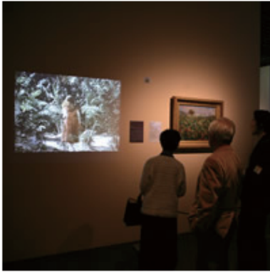
Renoir + Renoir Exhibit

The Daiwa Securities Group supports a wide range of cultural and artistic activities. As part of our support for the arts, we were the special sponsor of the "Renoir + Renoir" exhibit at the Bunkamura Museum of Art in Shibuya, Tokyo, from February to May 2008. This exhibit was also presented at the National Museum of Modern Art, Kyoto from May to July 2008. The exhibit took the novel approach of simultaneously introducing two giants of the art world, Pierre Renoir, and his impressionist paintings, and the films of his son, the director Jean Renoir. The exhibit was a great success. In addition, Daiwa continuously supports a wide range of cultural and artistic activities, such as sponsoring the Daiwa Shoken Group Presents the Opéra National de Paris (July) and the Takarazuka Revue Company Reserved Performance (October-December), as well as the JAL Byodo-in Temple Sound Stage (September).