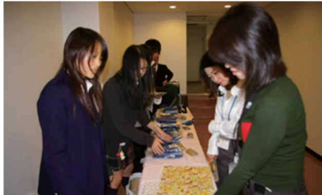
Student Company Program students selling their products

This is hands-on company management program in which high school students set up a company in school and operate it through all phases, from raising capital to recruiting personnel and handling the accounting, manufacturing and sales. The Daiwa Securities Group has been collaborating with the Student Company Program (SCP) at Ritsumeikan Senior High School since 2003. By fiscal 2008, Daiwa had sent a total of 16 employees as outside directors to offer advice on the preparation of financial data and on company management. Thus far, 131 students have acquired basic qualifications for gaining a living in society by learning about company management, how the world works, the difficulties of decision making, the pressure of bottom line accountability and the importance of leadership and teamwork.